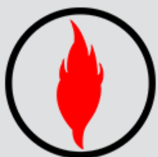
EGPC Egyptian General Petroleum Corporation