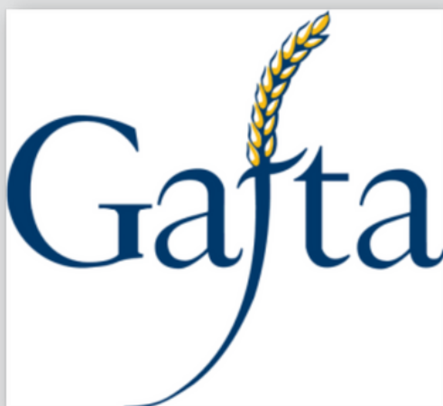
Grain and Feed Trade Association