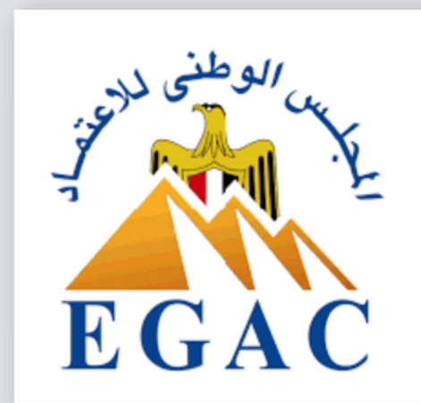
Egyptian Accreditation Council