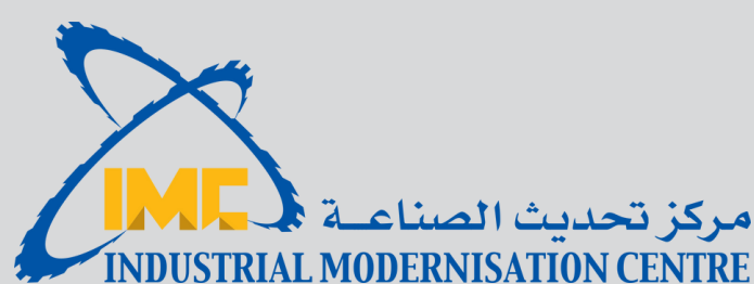
Industrial Modernization Center