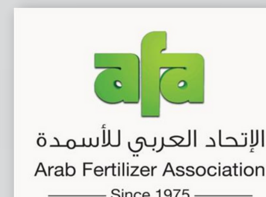
Arab Fertilizers Association